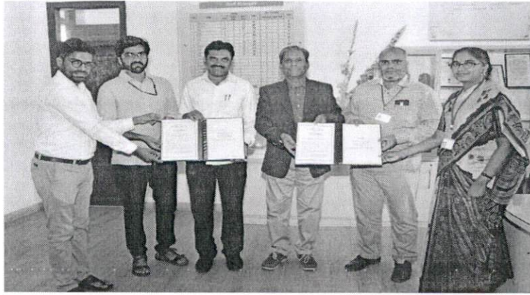
MoU with SRS IAS Academy on 28-10-2017 at Registrar's Office